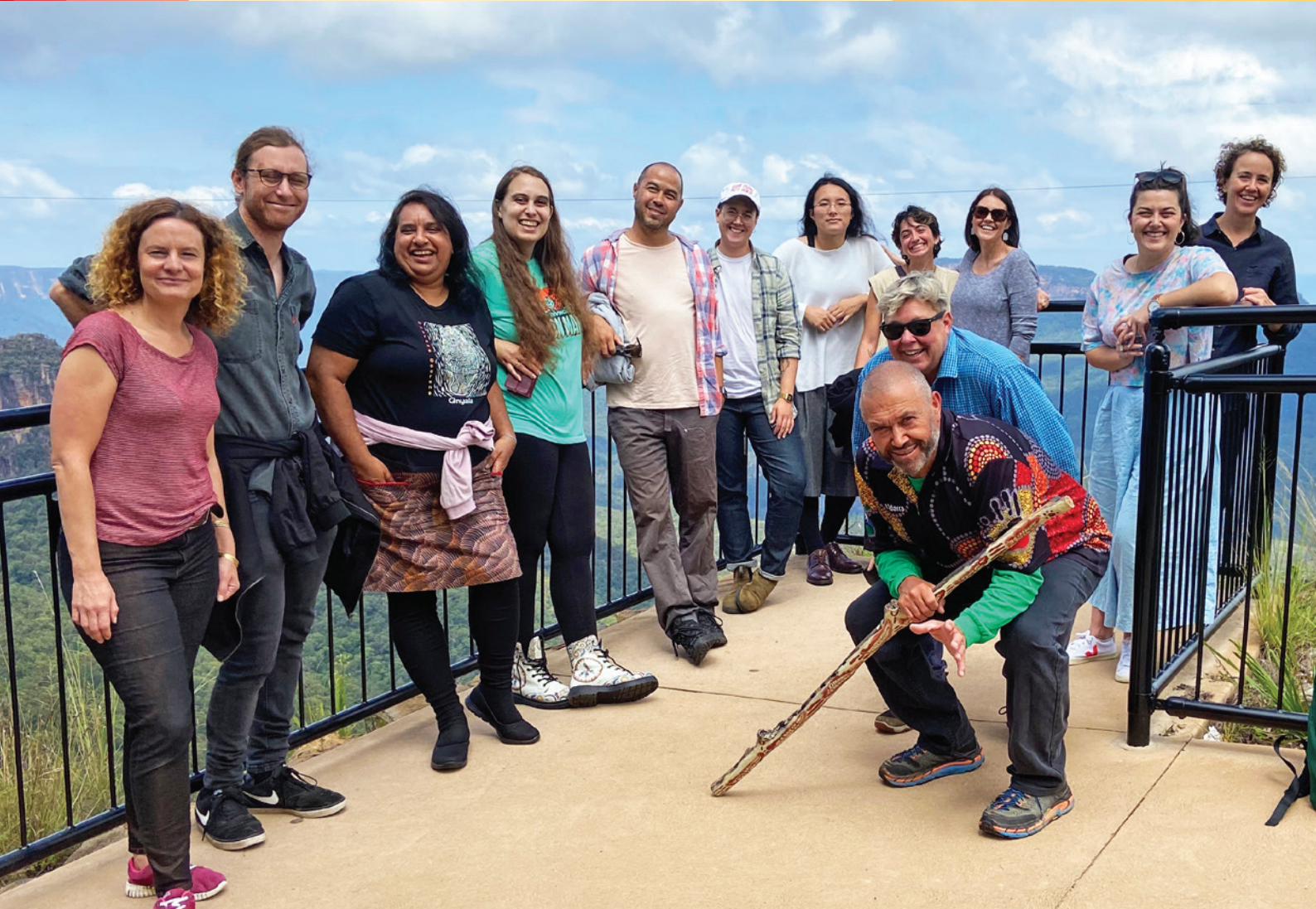
Writers at Katoomba Falls Lookout, March 2021